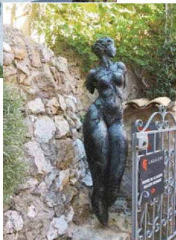
Seen in Eze Village France

Discover a unique collection of artworks