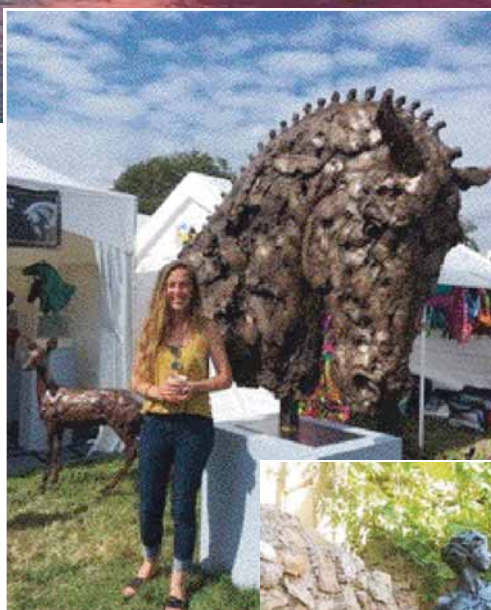
Holly exhibiting at the Alesford show